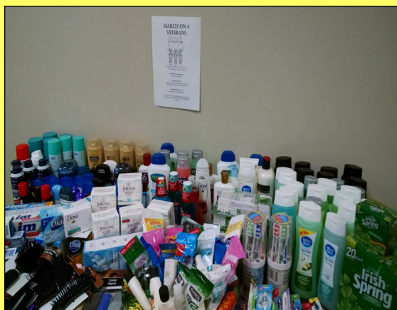
East Chapter Project: March on 4 Veterans

On February 25, 2016, the East Chapter Special Projects Committee members were awarded a 2,000.00 grant. This grant will help cover the expenses for students in the High School Job Club in Richmond, Burke and Jefferson counties to attend the High School Job Workshop, Resource Fair and Career Day during the 2015 – 2016 school term. The purpose of the High School Job Club is to prepare juniors and seniors for competitive employment in the community after graduation.