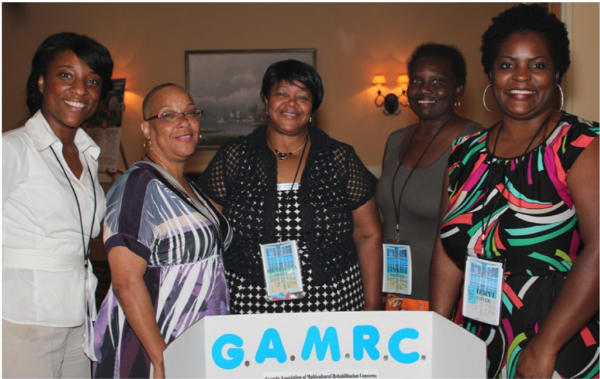
Georgia Association of Multi Cultural Rehabilitation Concerns (GAMRC)