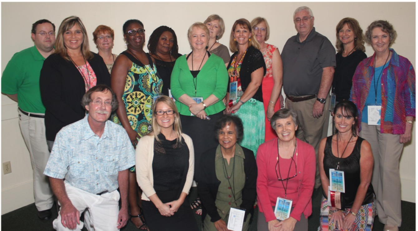
Georgia Association of Rehabilitation Leadership (GARL)