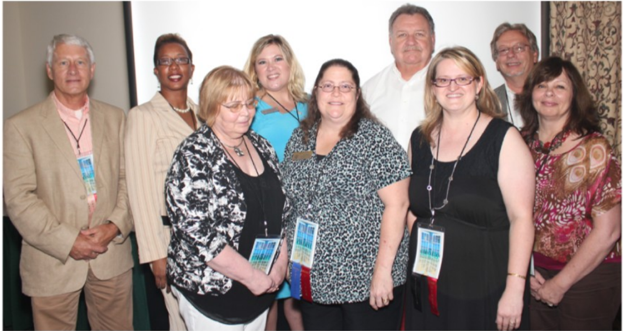
Georgia Rehabilitation Counselors and Educators Association (GRCEA)