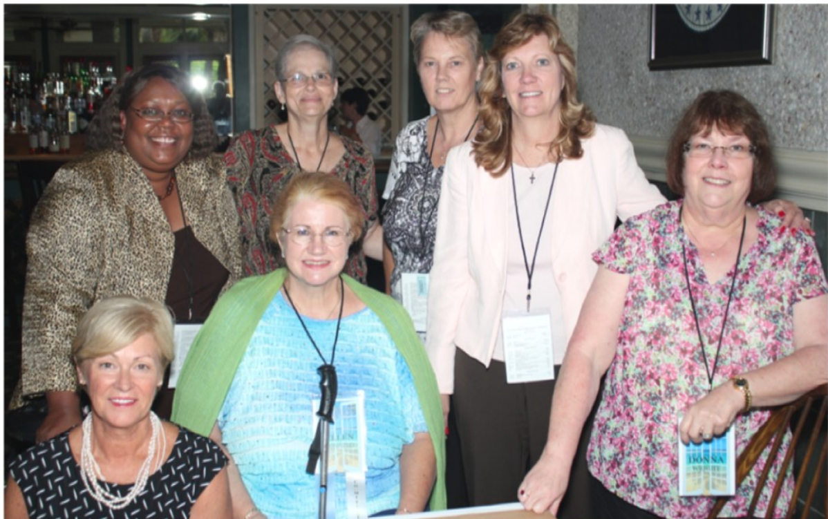
Association of Rehabilitation Technicians & Specialists of Georgia (ARTS)