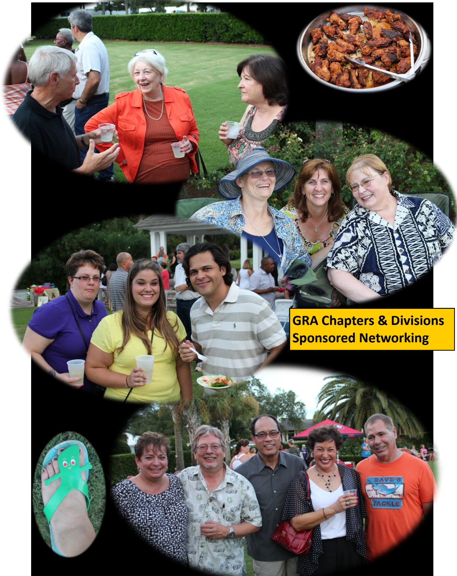
GRA Chapters & Divisions Sponsored Networking